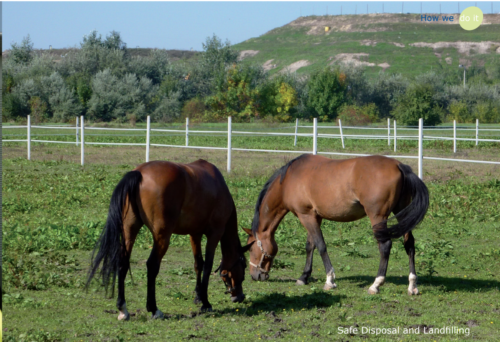
Safe Disposal and Landfilling

OUR LANDFILLS GENERATE ABOUT 88 GWH/A OF ENERGY